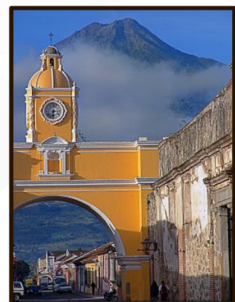
Antigua and one of its surrounding volcanos

This collaboration was a valuable opportunity for the MSSO to provide the first exposure to MedDRA to an audience of 16 regulators from Guatemala, El Salvador, Honduras, Nicaragua, Costa Rica, Panamá, Dominican Republic, and Belize.