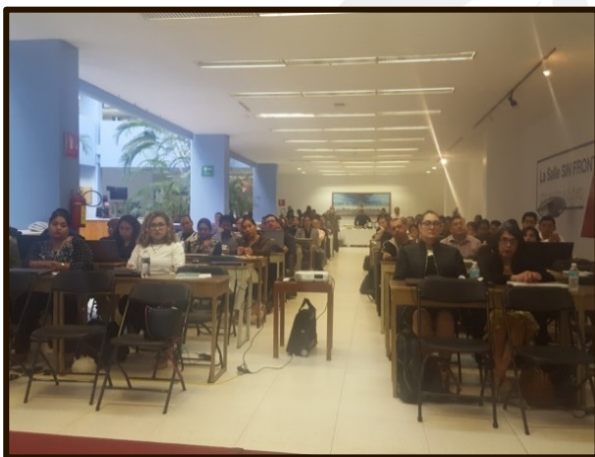
The audience in La Salle University

The Mexican regulator, Comisión Federal para la Protección contra Riesgos Sanitarios (COFEPRIS), asked the MSSO for two days of training for their staff on both coding and analysis aspects of MedDRA. An audience of approximately 100 participants comprising staff members from each of the 31 state regulatory centers met at the La Salle University of Ciudad de México on 17 and 18 October. COFEPRIS is implementing a new system of electronic transmission of safety reports to align with ICH requirements and has issued a new regulation, effective in January 2018, that will require public and private health care providers, MAHs, CROs, and other institutions working in clinical research to code medical information into MedDRA.