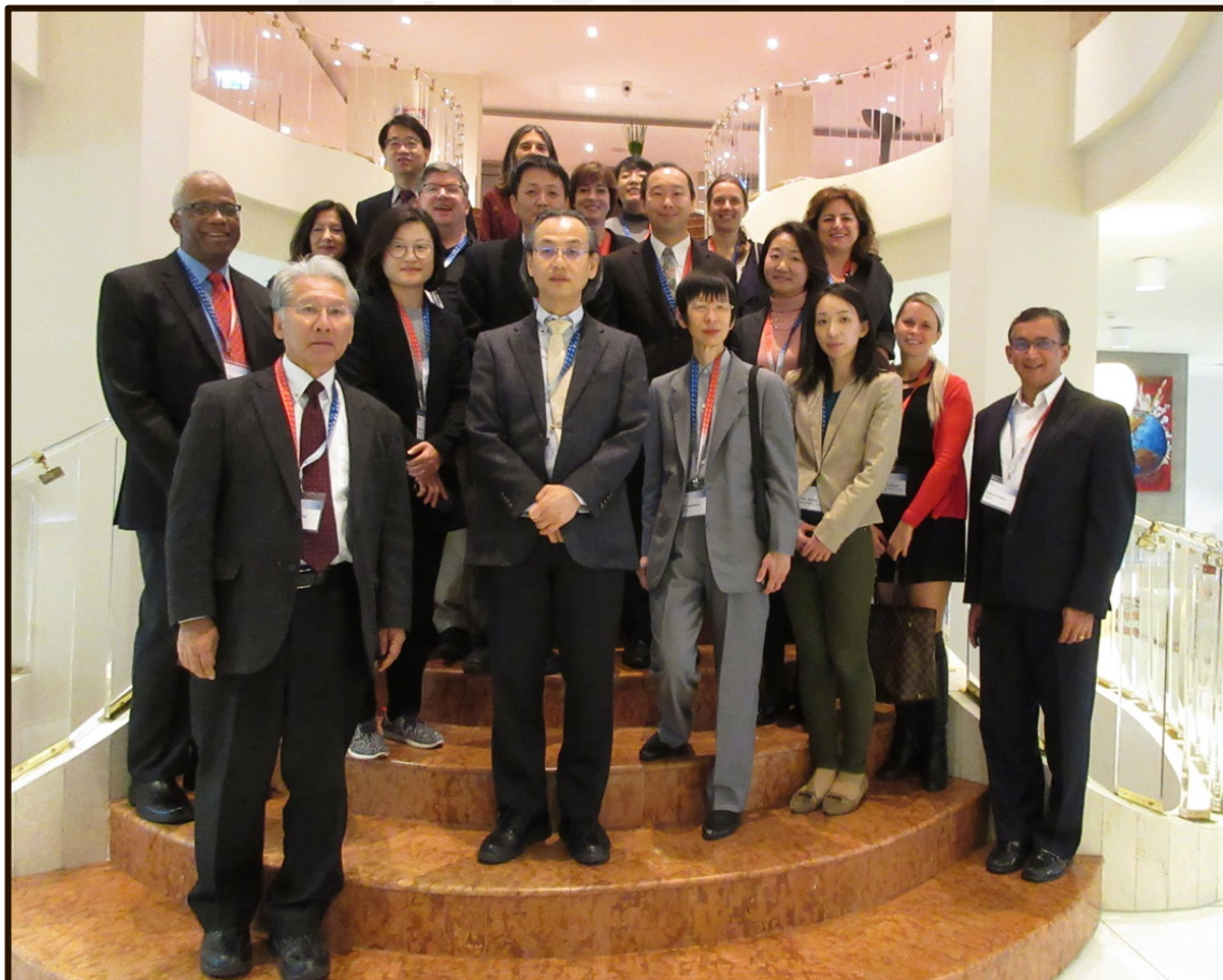
ICH M1 PtC Working Group members in Geneva. November 2017

The PtC Working Group invites MedDRA users to provide feedback on the main PtC documents as well as the Companion Document by sending an email to the MSSO Help Desk .